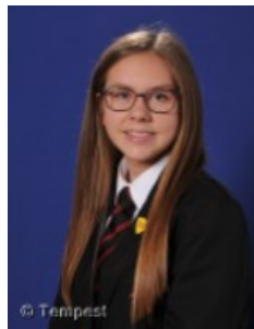
Rebecca Palmer Burrows Award for Commitment to School