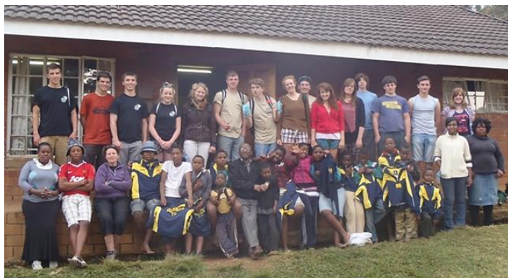
South Africa – helping to build a community school